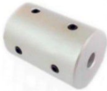
Setscrew type RC-S