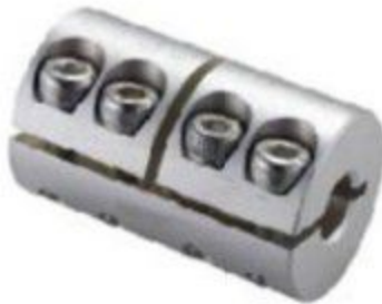
Clamp type RC-C